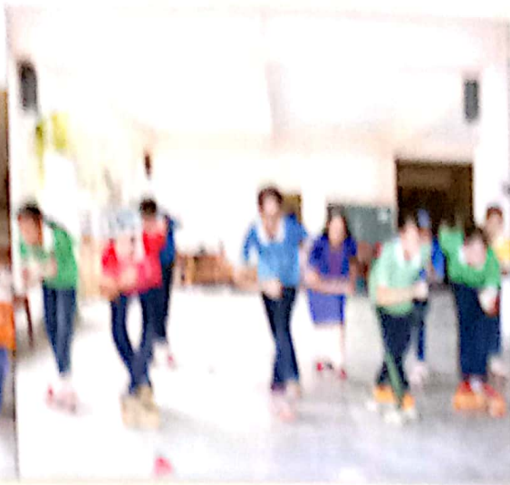
Roller Skating Club