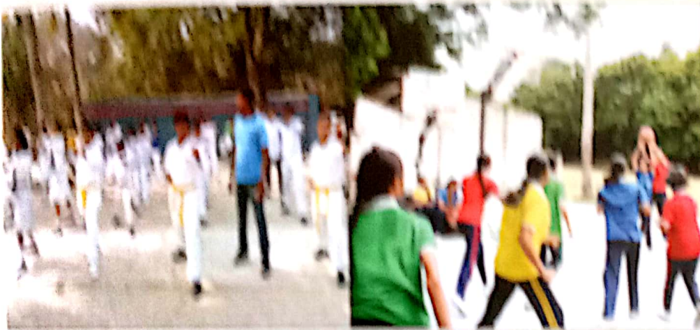
Martial Art Club